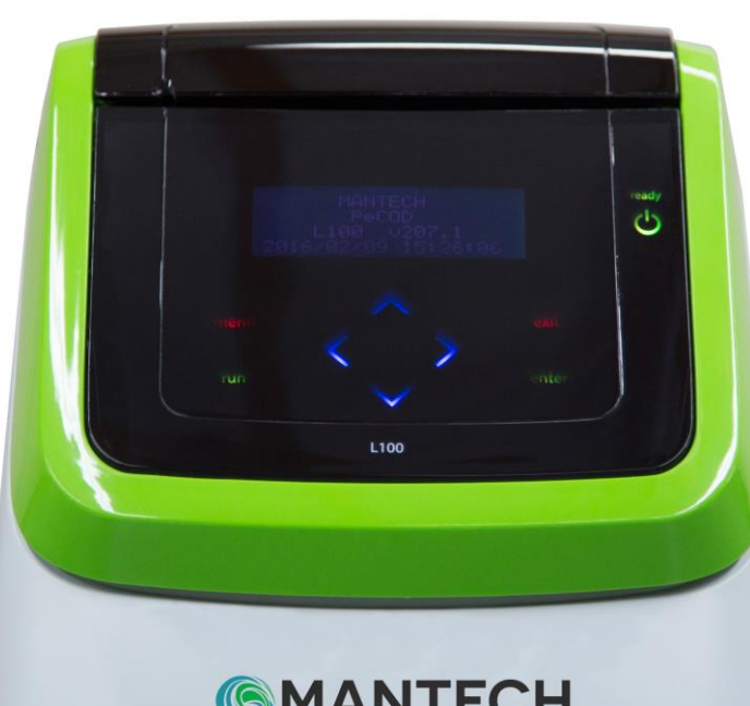
Figure 1: PeCOD configurations utilized during study. From left to right: laboratory L100, automated L100 and online P100 peCOD.

There were two peCOD configurations utilized in this project, automated L100 and online P100. Both use the same peCOD technology and consumables, but are setup to operate under different conditions.