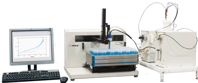
TitraSip System with AutoMax73 73x50ml tubes, common applications: pH, TA, Total and Free sulfite.

For additional information or specific wine application notes, please visit www.mantech-inc.com or e mail us: info@mantech-inc.com