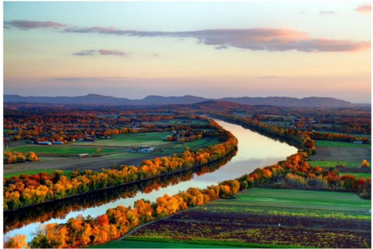
Figure 1: Connecticut River, Source Water for Millions of Residences in the Eastern U.S.

Safe operation of a Water Treatment Plant (WTP) requires careful monitoring of the water supply influent to the plant, as a guard for any substances entering the treatment works that could negatively impact treated water quality in the distribution system. One aspect of water quality that has recently garnered more attention from authorities and utilities is Natural Organic Matter (NOM), which refers to a group of carbon-based compounds found in natural water systems formed by the decomposition of organic materials and associated metabolic reactions. While NOM itself does not pose a risk to human health, some NOM compounds are known to react with chlorine and chloramines in drinking water treatment to produce disinfection by-products (DBPs) such as Trihalomethanes (THMs) and Haloacetic Acids (HAAs), which are known to be carcinogenic and/or genotoxic. Health Canada, the US Environmental Protection Agency, and the World Health Organization include sections focused on control of DBPs in their Drinking Water Treatment Guidelines.