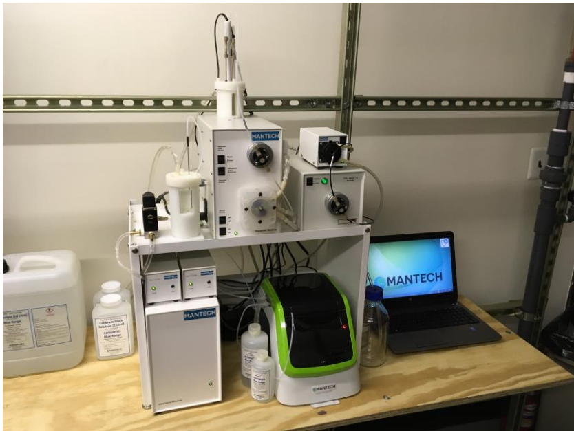
Figure 2: MANTECH Online PeCOD Analyzer

A drinking water utility in Massachusetts has recently adopted the peCOD parameter as part of an effort to predict and control the formation of DBPs. This utility receives source water from a tributary of the Connecticut River, a major watershed providing drinking water for millions of households in the Northeast U.S. states. The