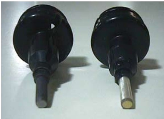
Figure 3. On the right is a properly prepared cathode and anode. Note the light silver appearance of the anode and matte finish of the gold cathode.

3. The gold cathode should be bright and have fine scratches covering the entire surface (See Figure 3). Do not attempt to create a “glass smooth” surface on the cathode, because the absence of scratches will prevent accurate readings from being measured. The gold cathode can also become plated with silver from the anode and tarnished from use with wrinkled membranes or after having contact with known interfering gases such as hydrogen sulfide.