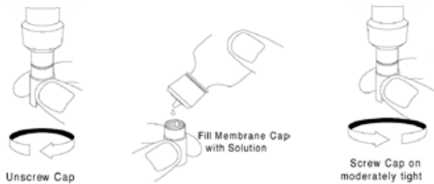
Figure 2. Installing a cap membrane couldn't be easier. Unscrew the old cap and discard. Fill the new cap a little less than halfway with solution. Screw the cap onto the sensor and rinse off any extra solution.

3. The gold cathode should be bright and have fine scratches covering the entire surface (See Figure 3). Do not attempt to create a “glass smooth” surface on the cathode, because the absence of scratches will prevent accurate readings from being measured. The gold cathode can also become plated with silver from the anode and tarnished from use with wrinkled membranes or after having contact with known interfering gases such as hydrogen sulfide.