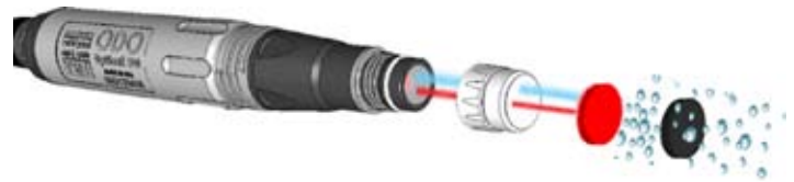
Figure 7. Oxygen is constantly diffusing through the paint layer, affecting the luminescence of the sensing layer.

The probe measures dissolved oxygen by emitting a blue light of the proper wavelength that causes the dye in the sensing element to luminesce, or glow red. Oxygen dissolved in the sample continually passes through the diffusion layer to the dye layer, affecting the luminescence of the dye both in intensity and lifetime. The YSI sensor measures lifetime of the dye’s luminescence as it is affected by the presence of oxygen with a photodiode (light detector) in the probe and compares that reading to a reference. See Figure 7.