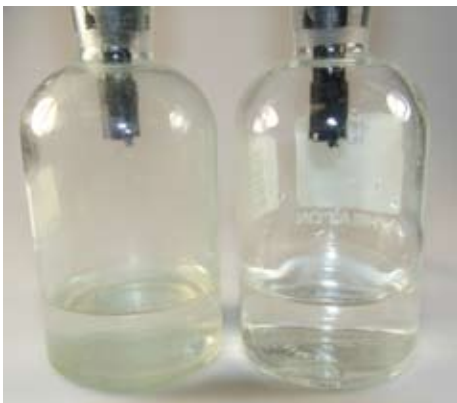
Figure 6. The calibration bottle on the right is clean. The calibration bottle on the left actually has algae growing in it which could affect the calibration values.

In addition, make sure the calibration environment is clean. Change the water in the BOD bottles occasionally and use a