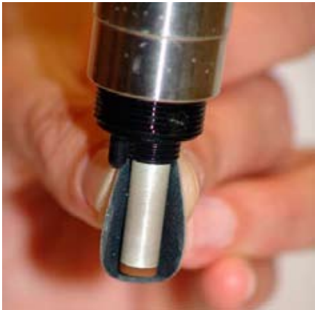
Figure 5. The silver cathode being sanded with a 400 grit wet/dry sanding disc to properly clean the anode from build-up and tarnishing.

1. To physically clean the electrodes on the DO membrane cap-style probes, you can wet sand the anode with 400 grit sand paper. Simply wrap the sanding disc around the anode (silver portion making up the shaft of the sensor) and, in a helical fashion, twist the sanding disc down and around.